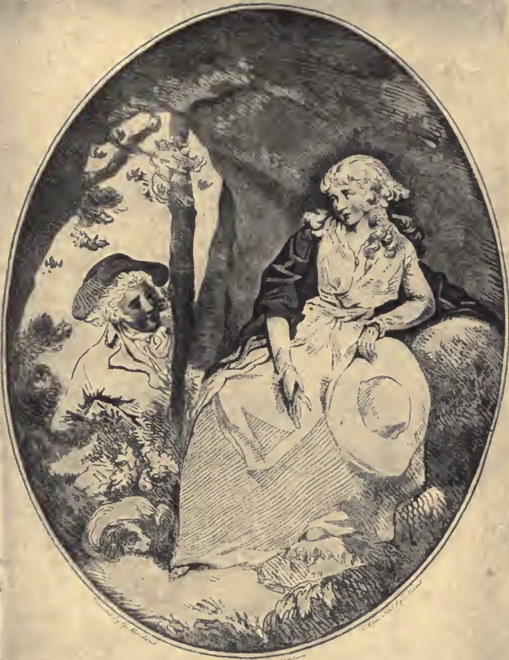
The LISTNING LOVER